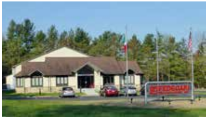
FEDEGARI TECHNOLOGIES, INC.