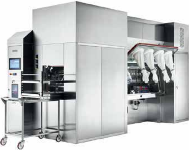
FOFxx + FCISxx Saturated steam sterilizer + Isolator