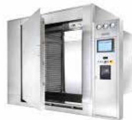
FOD Series Sterilization & depyrogenation ovens