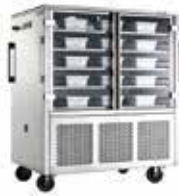
FHC Series Laminar flow mobile safe-carts