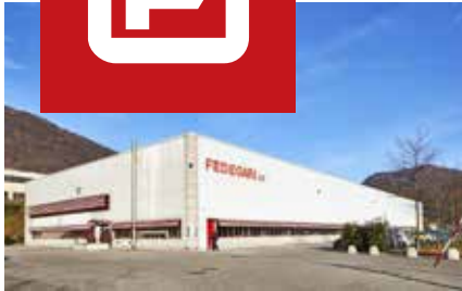
FEDEGARI (SUISSE) SA

New Inox was opened in 2003 as a joint venture with partners of Fedegari with the goal of providing specialized field services where structural works are needed. This specialization is requested where special machines and plants are installed or where structural modifications (like those typical of a revamp) are carried out.