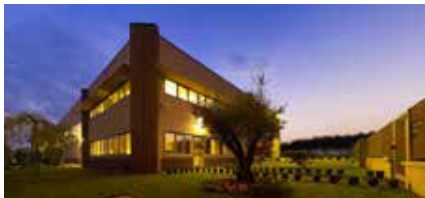
NEW INOX SRL