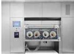
FCIS Series Isolators