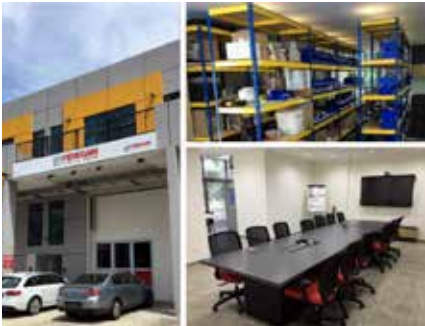
FEDEGARI ASIA PTE. LTD.