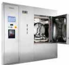
FOT Series Integrated solutions for pharmaceutical closures processing