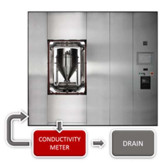
Figure 4 - Schematic view of the online application of conductivity sensors in Fedegari steam washers.