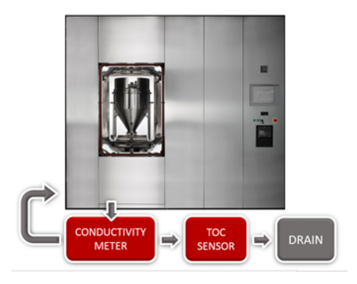
Figure 5 - Schematic view of the online application of conductivity and Total Organic Carbon sensors in Fedegari washing machines.

This case study regards the online application of the conductivity and Total Organic Carbon sensors in Fedegari steam washers. In these machines, both the conductivity meter and the TOC analyzer are integrated in the hydraulic system and connected to the process controller (see Figure 5).