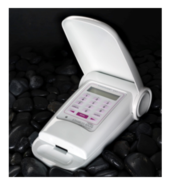
Figure 2 – Endosafe PTS instrument, manufactured by Charles River, used for the evaluation of the endotoxin load of the samples being considered.

The instrument used (see Figure 2), Endosafe PTS (Charles River), is a portable cartridge spectrophotometer, which measures the endotoxin content as a function of the time required to develop a given quantity of color. The higher is the endotoxin content; the lower is the response time.