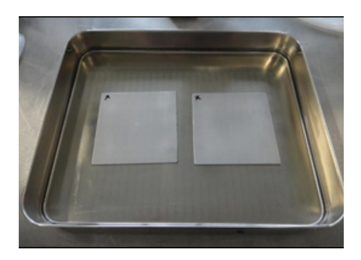
Figure 3 - Coupons immersed in water for injection; recovery of endotoxin content.

Figure 2 – Endosafe PTS instrument, manufactured by Charles River, used for the evaluation of the endotoxin load of the samples being considered.