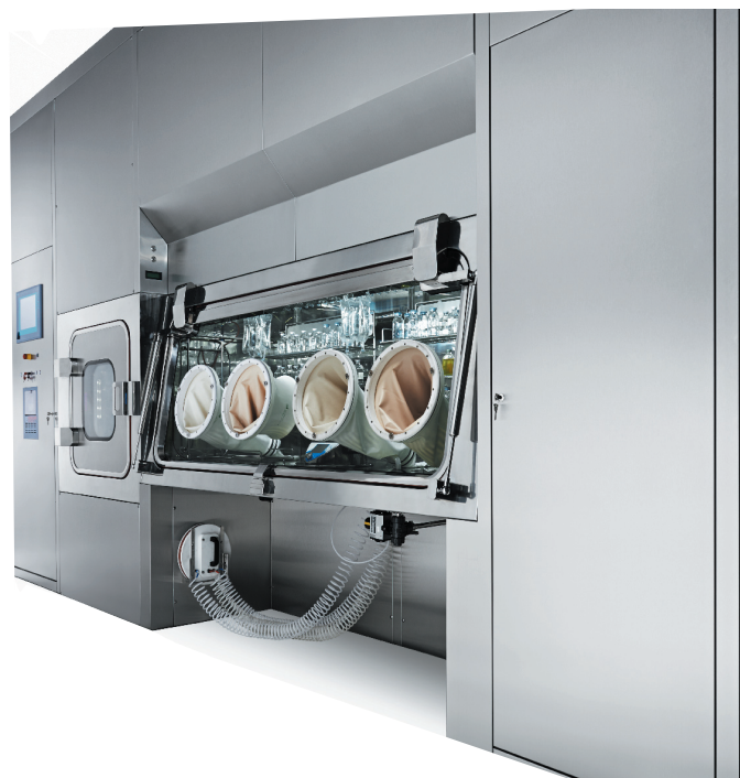
Fig. 3– General view of a Sterility Test Isolator